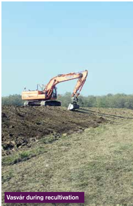
Vasvár during recultivation