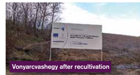
Vonyarcvashegy after recultivation