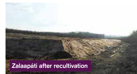
Zalaapáti after recultivation