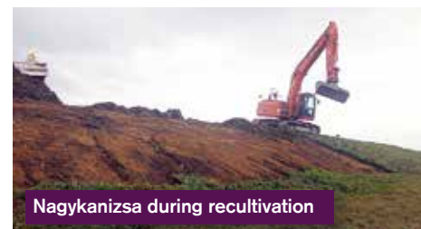
Nagykanizsa during recultivation