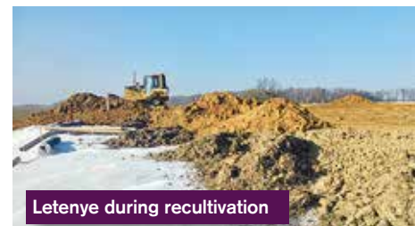
Letenye during recultivation