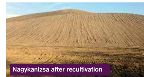
Nagykanizsa after recultivation