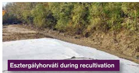
Esztergályhorváti during recultivation