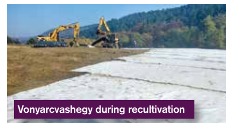
Vonyarcvashegy during recultivation