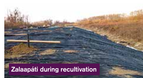
Zalaapáti during recultivation