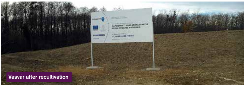
Vasvár after recultivation