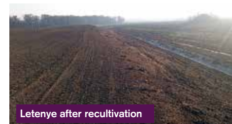
Letenye after recultivation