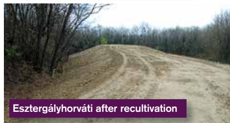
Esztergályhorváti after recultivation